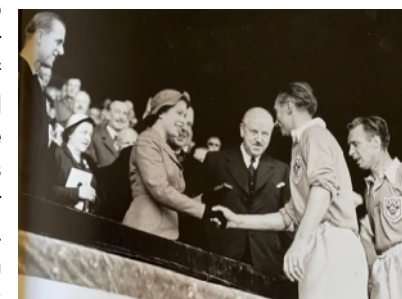
Queen Elizabeth II presents Stanley Matthews with his FA Cup Winners medal in 1953

Major developments continued with the arrival of Grandstand on BBC1, Match of the Day, originally on BBC2, and World of Sport on ITV, the latter covering such esoteric activities as canal-leaping and lumberjack or logger sports! Personalities began to have a