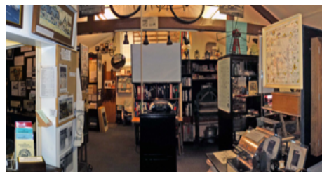
Haddenham Museum—lots to see