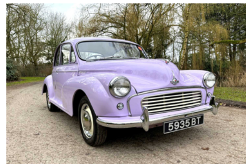
A Lilac 'Million' Morris Minor